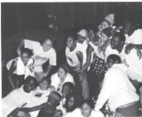
Young women gather for a group photo at the Young Women's Conference, hosted by Seattle Young People's Project