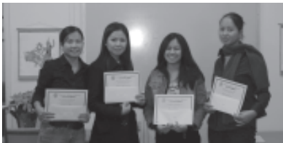
CWA Seed Fund scholarship recipients

The agencies had to raise the gifts from either new donors or increased gifts from current donors. After each agency met their challenge grant goal of $500 and received their challenge funds from WFA, they granted out the funds in the form of scholarships to individual women and girls in their communities.