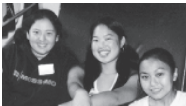
Attendees at the Young Women's Conference

For more information on the Seattle Young People's Project, please visit www.sypp.org .