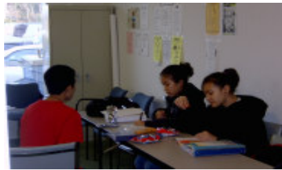
Students in the tutoring program of Cambodian Women's Association