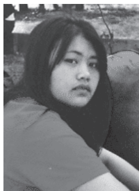
A young woman from Seattle Young People's Project

Washington State has more women than ever in politics and education, and has a great number of inspiring nonprofits working to make the lives of women and girls better.